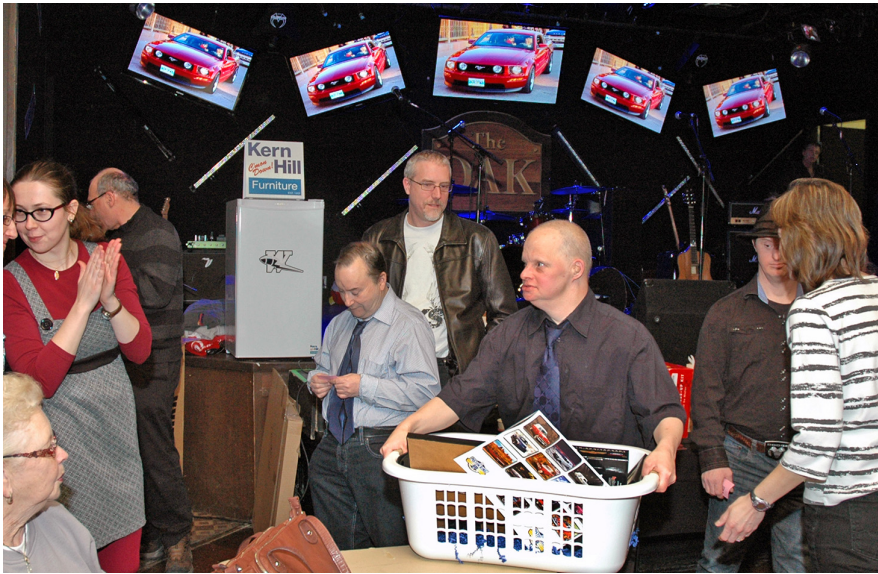
Prize draws at last year's Cruise the 'Peg event