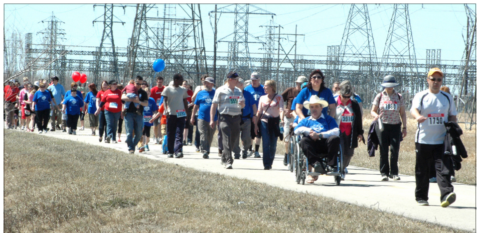
We were blessed with a warm sunny day for our very successful 2013 Walk

With the upcoming sharp increase in the cost of stamps, we have decided that our next newsletter (June) will be an email edition only. If you are receiving this newsletter by mail, please send us your email address so that we may continue sending you our news with Gratitude . Send to: newsletter@larchewinnipeg.org