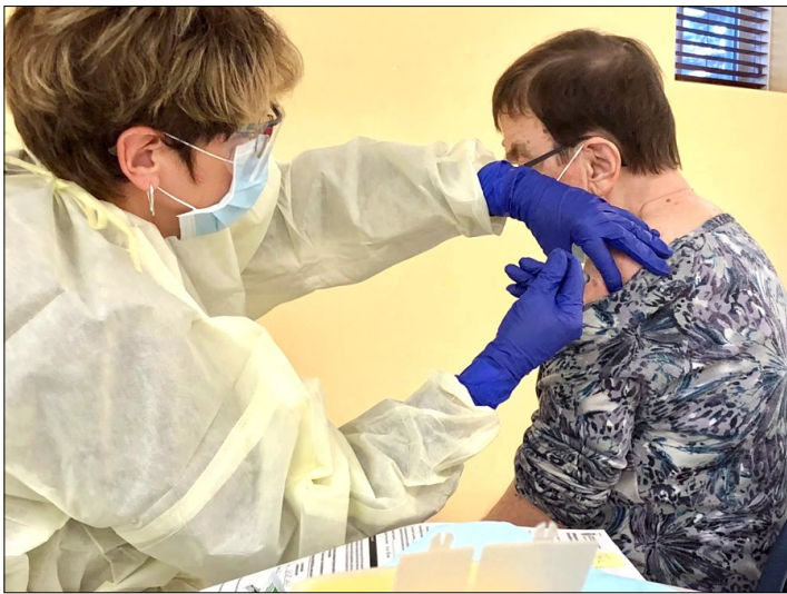
Getting the flu shot last fall

I don't know anyone who has not struggled with the isolation of dealing with Covid. For our core members who love to go out into the broader community to interact with people including other customers, cashiers, and waitresses at our L'Arche Tova Café, it has been a challenge. And yet as I see them on Zoom calls or talk to them on the phone they seem to be doing better than most of us. I think it is probably because they intuitively understand that the most important aspect of life is relationships, friendships, if you like, love. They are living with people who love them and whom they love and so life in the isolation of their home is more than bearable.