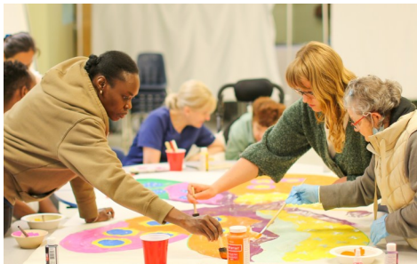
Painting at Community Circle

embody the joy of music, some of them with an enviable lack of inhibition.